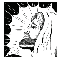
His Face Shone Like The Sun.